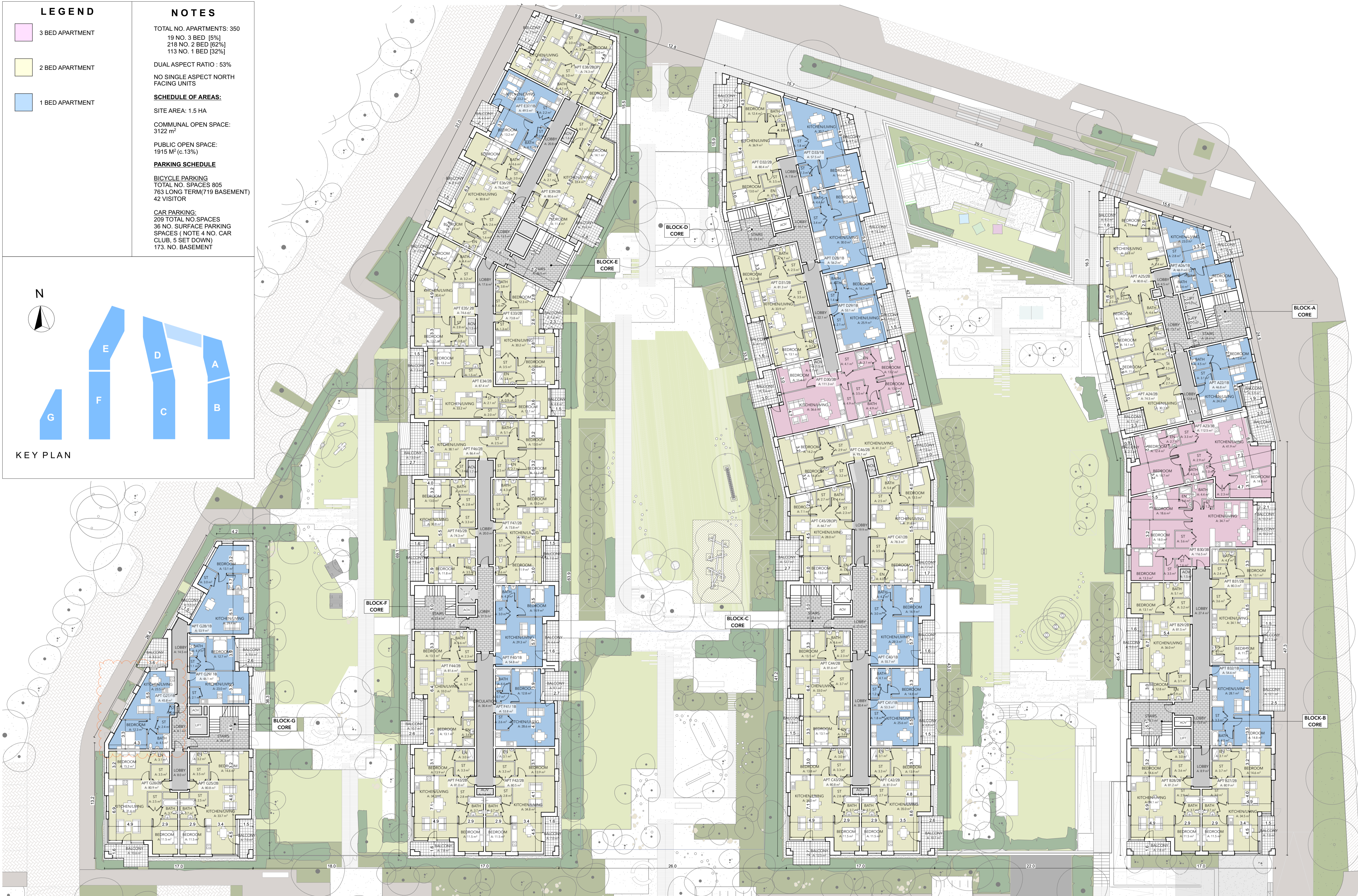
Fifth Floor Plan SCALE : 1:200